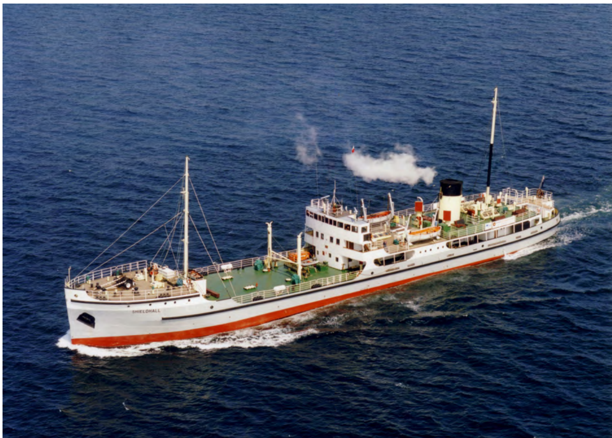
The SS Shieldhall - our meeting venue (though we don't put to sea!)

The Southern Region holds regular meetings on the second Wednesday of most months (except July and August), at which a variety of presentations of interest to members are given by guest speakers; we also hold occasional social events. Our meetings are normally held in Southampton on board the historic preserved steam ship SS Shieldhall ( www.ss-shieldhall.co.uk ), but sometimes events are arranged elsewhere in the Region, according to demand. We would be really pleased to welcome members old and new to our meetings, which always feature excellent presentations, and provide valuable opportunities to enhance your professional development, as well as the chance to socialise, exchange ideas and make business contacts with like minded colleagues.